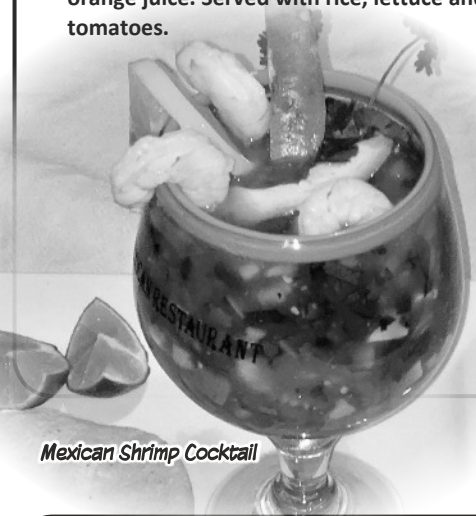
Mexican Shrimp Cocktail